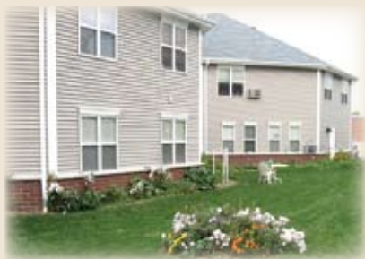
La Villa 5801 West Lakefield Dr. Milwaukee, WI 53219