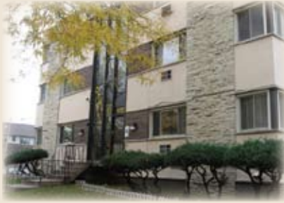
Santa Cruz 3029 West Wells St. Milwaukee, WI 53208