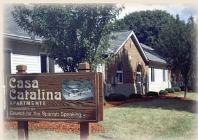
Casa Catalina 3640 West Mitchell St. Milwaukee, WI 53215