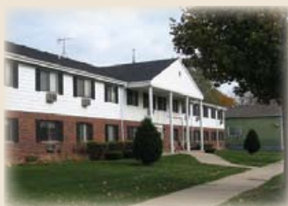
El Jardin I 920 West Madison St. Milwaukee, WI 53204