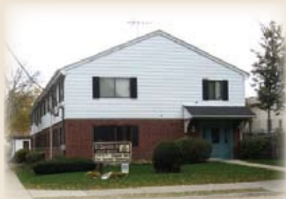
El Jardin II 1504 South 6th St. Milwaukee, WI 53204