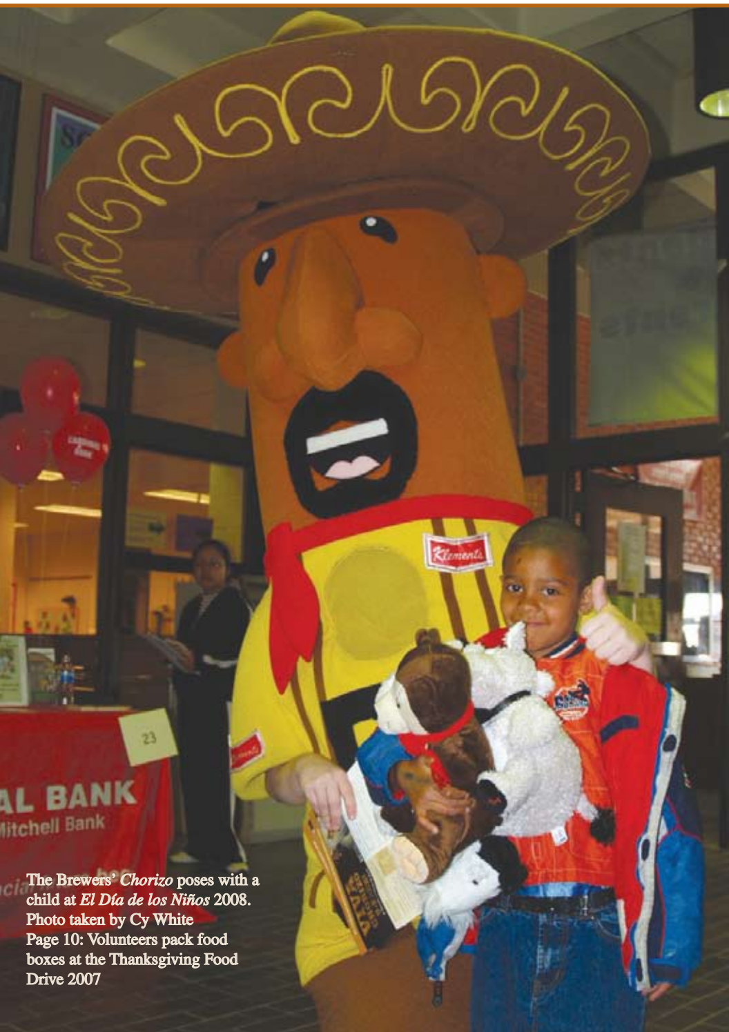
The Brewers' Chorizo poses with a child at El Día de los Niños 2008. Page 10: Volunteers pack food boxes at the Thanksgiving Food Drive 2007