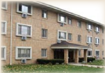
La Paz 1313 South 6th St. Milwaukee, WI 53204